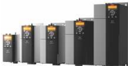
VLT® Midi Drive FC 280