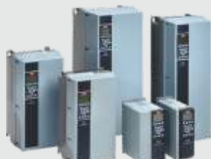
VLT® AutomationDrive FC 302