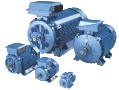
ABB is among the world's leading manufacturers of low voltage induction motors, with over 100 years of experience.

ABB motors offer unmatched quality & reliability, superior technology, faster delivery & above all "Value" for money.