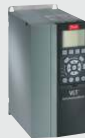
VLT® Refrigeration Drive FC 103