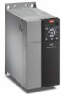
VLT® Automation Drive FC 360