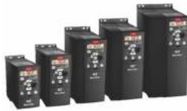
VLT® Micro Drive FC 51