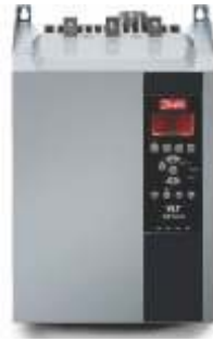
The VLT® Soft Starter MCD 500