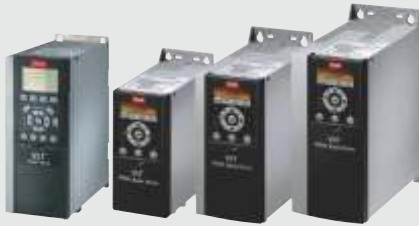
VLT® HVAC Drive FC 102